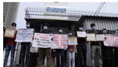
Rohingya refugees protesting the closure of the UNHCR Office in Colombo, Photo credit: AP

Two years ago the Sri Lanka Navy rescued more than one hundred Rohingya refugees and brought them to Colombo, where they are still languishing, with little