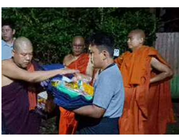
Click this image to access a short video of the distribution of relief aid.