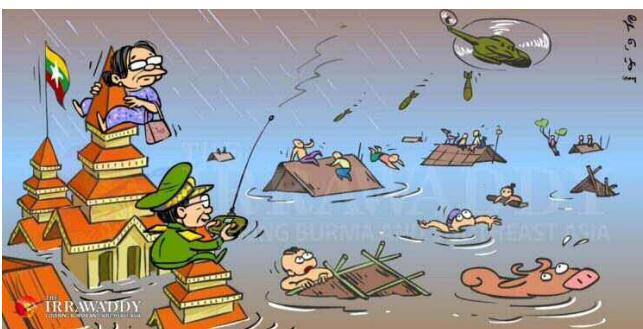
No Mercy, Only Destruction, By Beruma, The Irrawaddy