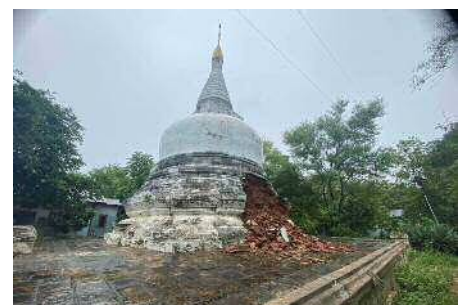
One of the damaged pagodas in the ancient capital of Pagan.