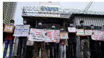
Rohingya refugees protesting the closure of the UNHCR Office in Colombo, Photo credit: AP

Two years ago the Sri Lanka Navy rescued more than one hundred Rohingya refugees and brought them to Colombo, where they are still languishing, with little