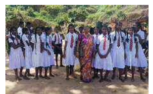
Click this image to watch a video of the dance which the two students performed.