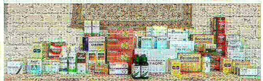
Medicine for the Kandy Cancer Home