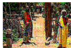
Veddas: The First People Of Sri Lanka by Thiva Arunagirinathan

< https://roar.media/english/life/culture-identities/veddas-the-first-people-of-sri-lanka >