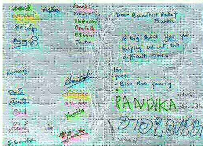
Blue Rose Special School, Kandy