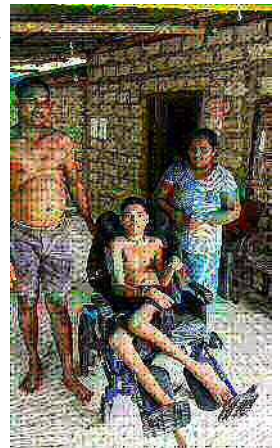
This special wheelchair was ordered from Colombo and donated to this boy.

The economic crisis in Sri Lanka continues unabated. Shortages of food, medicine, and fuel have caused many businesses to close, and many people have lost their jobs. Since the beginning of the year about 3000 doctors have left the country. Relief funds are still greatly needed.