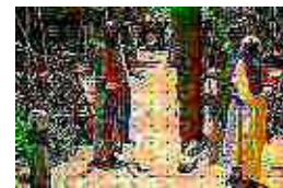
Veddas: The First People Of Sri Lanka by Thiva Arunagirinathan

< https://roar.media/english/life/culture-identities/veddas-the-first-people-of-sri-lanka >