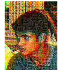
These four photos are from our visit to the school in 2009 with the Sai Baba Association.

https://www.paypal.com/donate/?hosted_button_id=E4PWEKXHBG55G