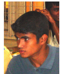
These four photos are from our visit to the school in 2009 with the Sai Baba Association.

< https://www.paypal.com/donate/?hosted_button_id=E4PWEKXHBG55G >